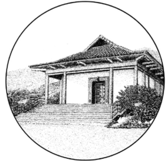
Santa Barbara Temple

"Just imagine Hanuman's state of mind ... He longed only for God." —Sri Ramakrishna